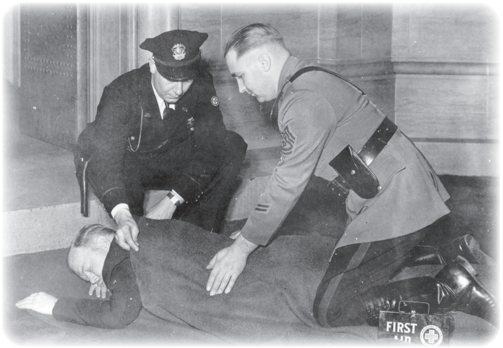
Members received First Aid training for the first time in 1936. The Red Cross emblem was added to the uniform above the left elbow.

General Order #10, issued March 5, required officers to carry "civilian badges" while off duty. Any officer losing the badge would be fined $10 plus the cost of replacing the badge. The civilian badges were recalled April 10, 1947. Failing to return the badge resulted in a $6 fine; loss of a Patrol commission card was to result in a $10 fine. March 1, 1948, the civilian badges were reissued, and the $10 penalty for losing it was reinstated.