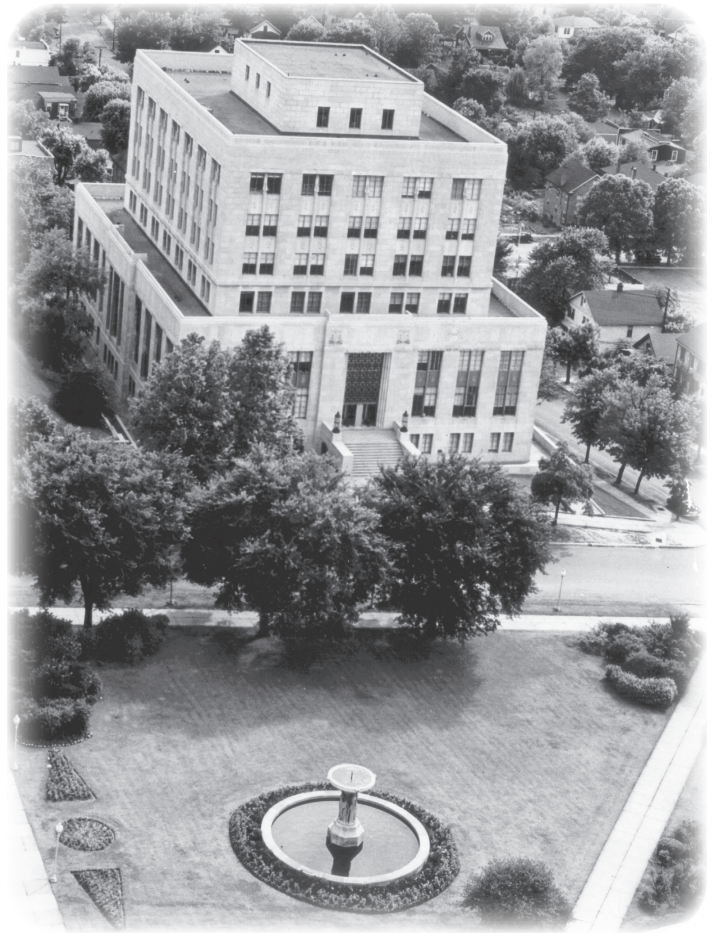
In 1938, General Headquarters was moved from the Capitol to the Broadway State Office Building in Jefferson City.

Headquarters was moved from House Room 309 in the Capitol to the Broadway State Office Building in Jefferson City.