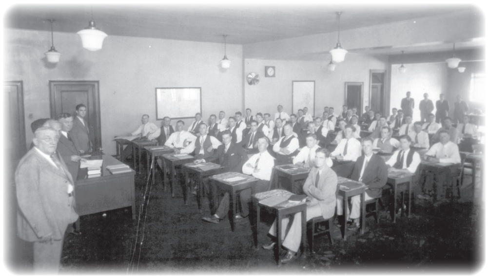
The first class of recruits are shown in a classroom at St. Louis Police Training Academy in 1931.

The motor vehicle fleet for these first patrolmen consisted of 36 new Model A Ford Roadsters, a Ford sedan, a Plymouth sedan, an Oldsmobile, a Buick, three Chevrolets, and 12 Harley Davidson, three Indian, and two Henderson motorcycles. The Roadsters, which cost $413.18 each, had twin Klaxon horns, a spotlight, a fire extinguisher, a first aid kit, and an electric “Patrol” sign behind the right side of the windshield. All vehicles had